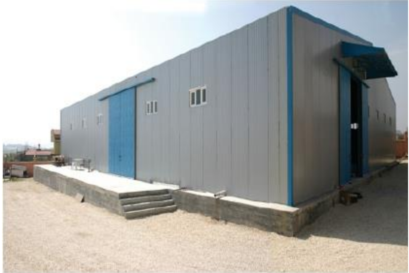
Storage Warehouse Structures